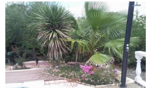
Solar shower by pool