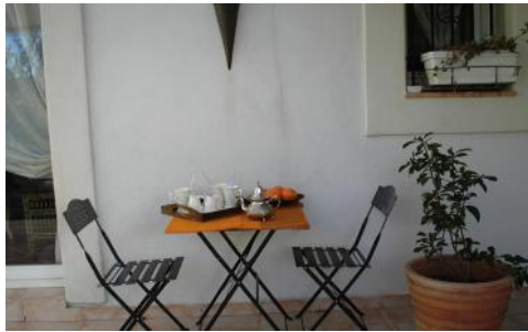
Tea on front terrace