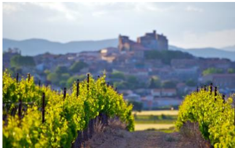
Puissalicon, the next village