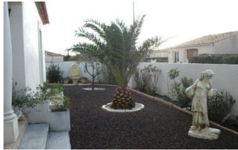
Front of villa