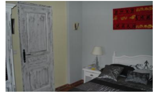
Double bedroom on ground floor