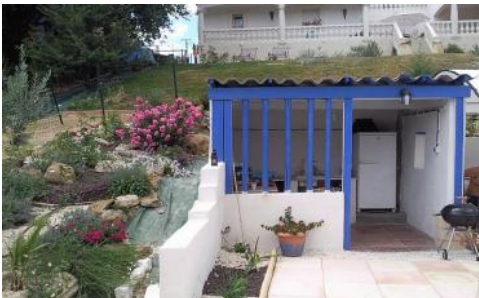
Summer kitchen by pool