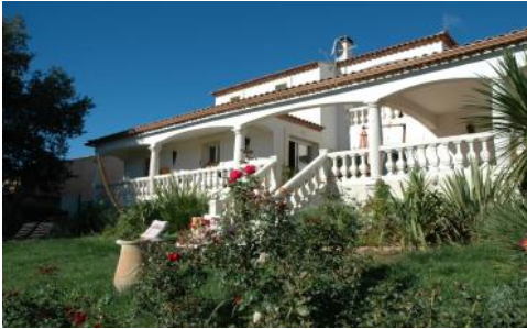
Villa from lower garden