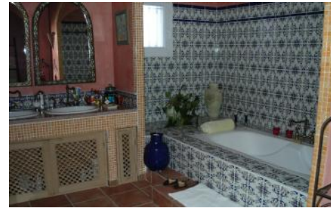
Ensuite bathroom to top bedroom