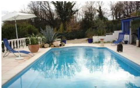
Pool and terrace