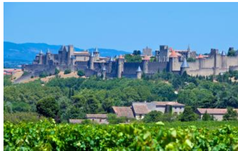
Carcassonne, a bit over an hour away