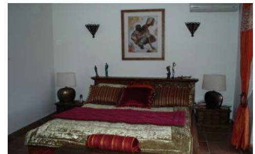
Top double bedroom with ensuite and terrace