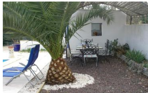
Shady eating area by pool