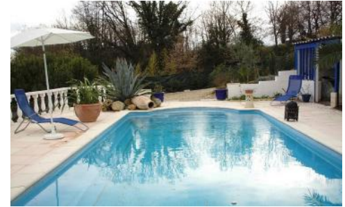
Pool and terrace