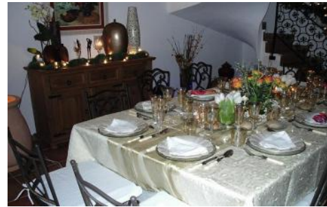
Table set for fine dining!