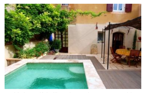
This beautiful village house has a stone table outside, sunloungers and a sun awning to welcome the shade! It also has a small pool with stone seats in it. There's also a pool alarm for the security of your children. Fabulous isn't it?