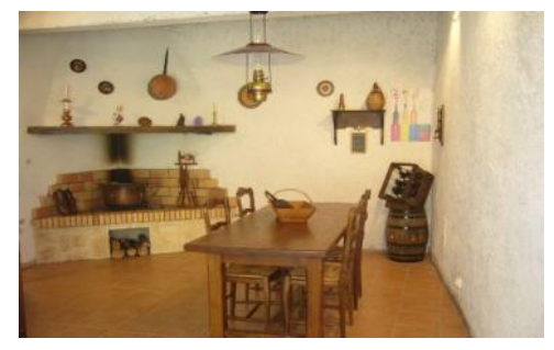
The pool house. It has a shower room, washing machine and a large chimney for evening BBQs. This room is multifunctional: use it as the pool house, games room or evening dining area. Choose the function that fits you best at the time!