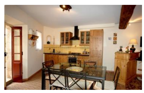
This village house has an open kitchen with comfortable seating and a bar. The kitchen is modern and has all sorts of new, high quality items. Fully equipped.