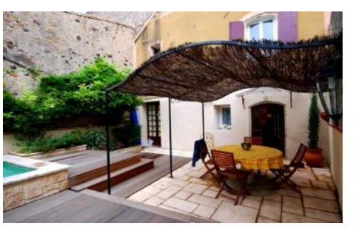
A closer look at the sun awning. It comes in handy to provide shade while you're eating outside.