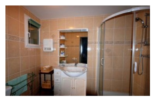
This is the shower room in the pool house. There's also a basin and WC.