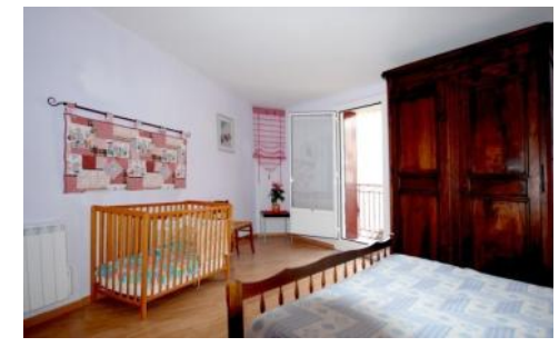
This village house has three bedrooms total. Here you can see the double bedroom plus a cot that's available. Perfect for a young family!