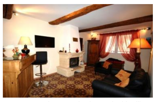
Here you see the open plan lounge in this village house. There is a bar, a woodburning fire and LCD flat screen TV. Very cosy! Nicely decorated with traditional French wooden furniture!