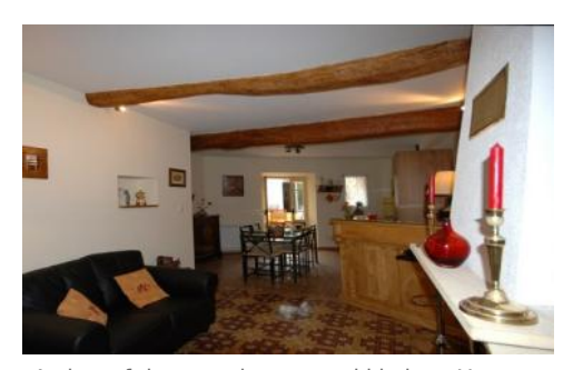
A view of the open lounge and kitchen. You can also see the bar/buffet and a comfy sofa.