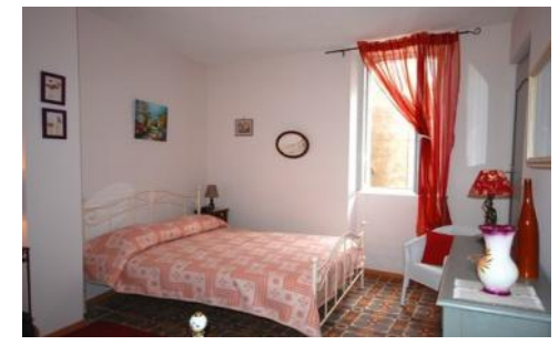
This bedroom has a small double bed (for one person).