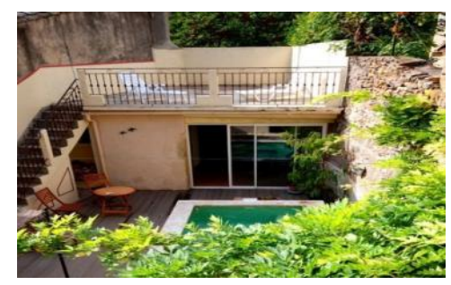
A view of the pool, the stairs that lead to the top terrace and the pool house! The whole courtyard, pool and terrace are completely private. You will definitely enjoy your stay in this village house!